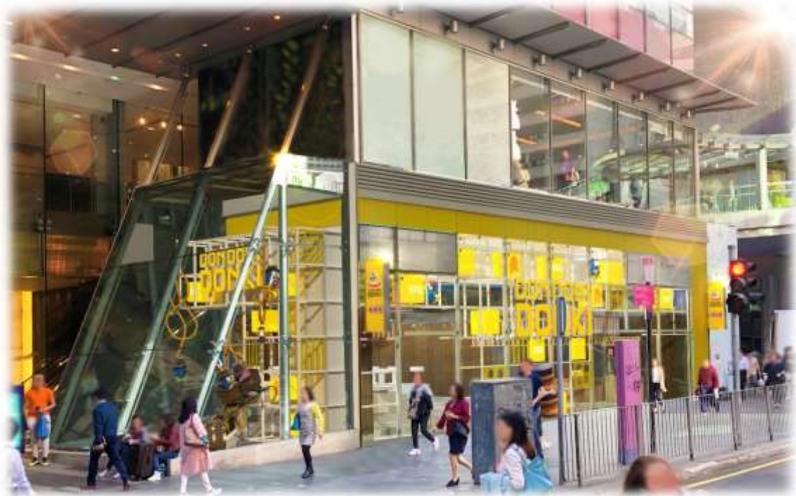
Photo download: https://bit.ly/36LFE7H

First street store operating 24 hours in Hong Kong featuring a huge decoration 100QRC exclusive bento menu reveals, bringing the vibrant DON DON DONKI culture to customers the bustling Central area